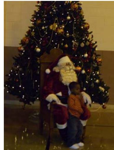
2009 Inmate Fellowship Angel Tree Party